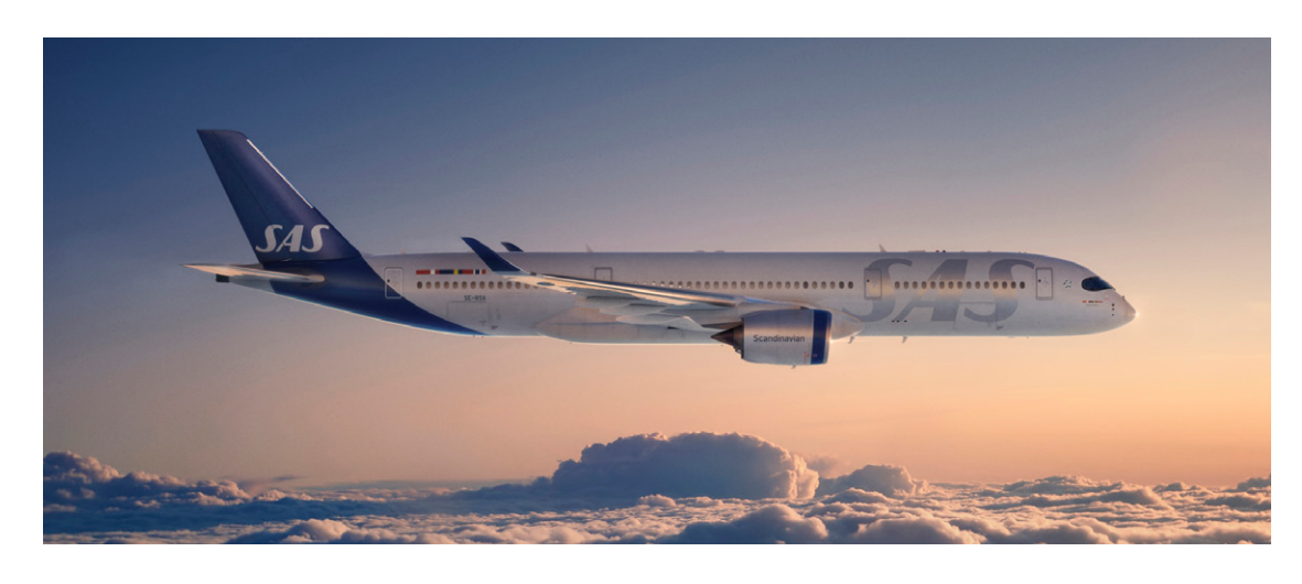
The new fleet lowers fuel consumption and thereby CO2 emissions.